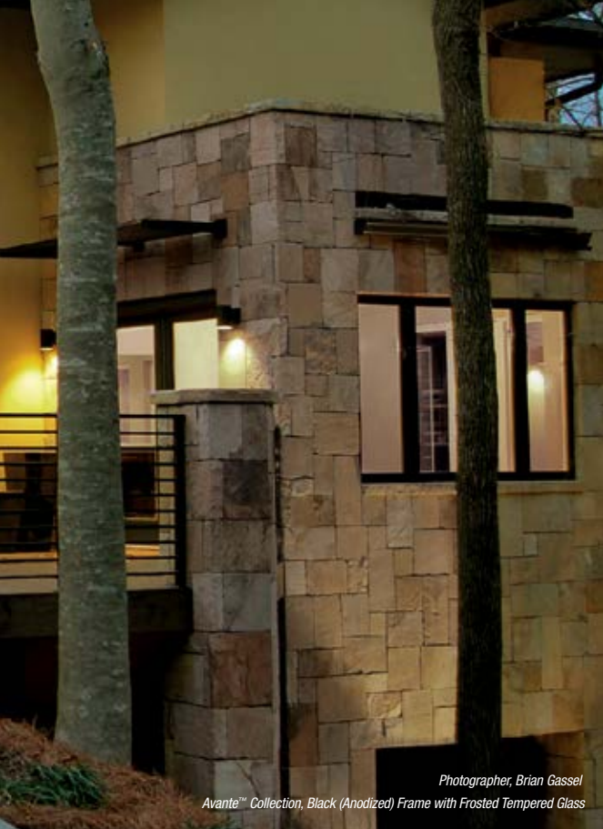
Photographer, Brian Cassel Avante™ Collection, Black (Anodized) Frame with Frosted Tempered Glass