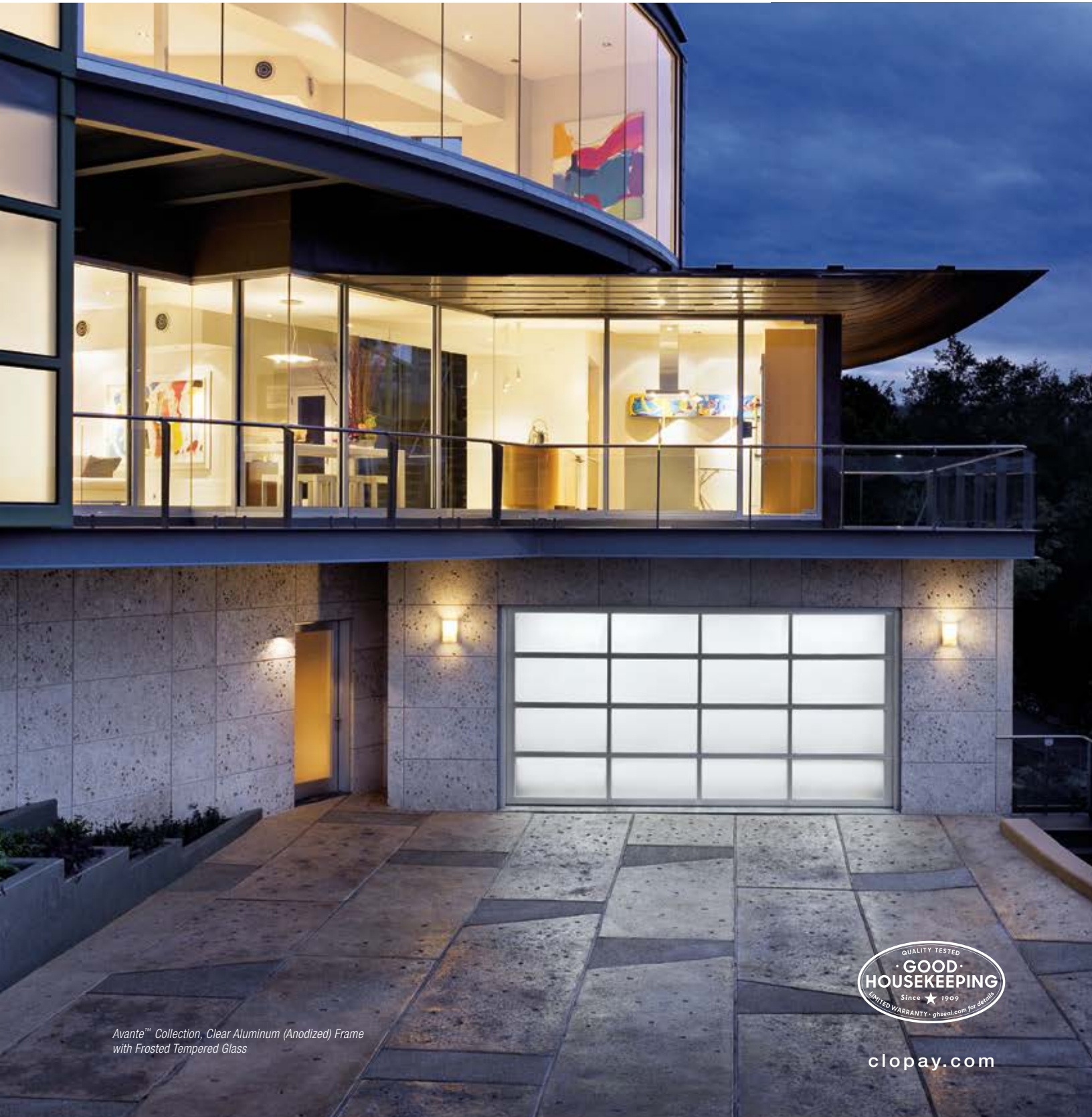
Avante™ Collection, Clear Aluminum (Anodized) Frame with Frosted Tempered Glass