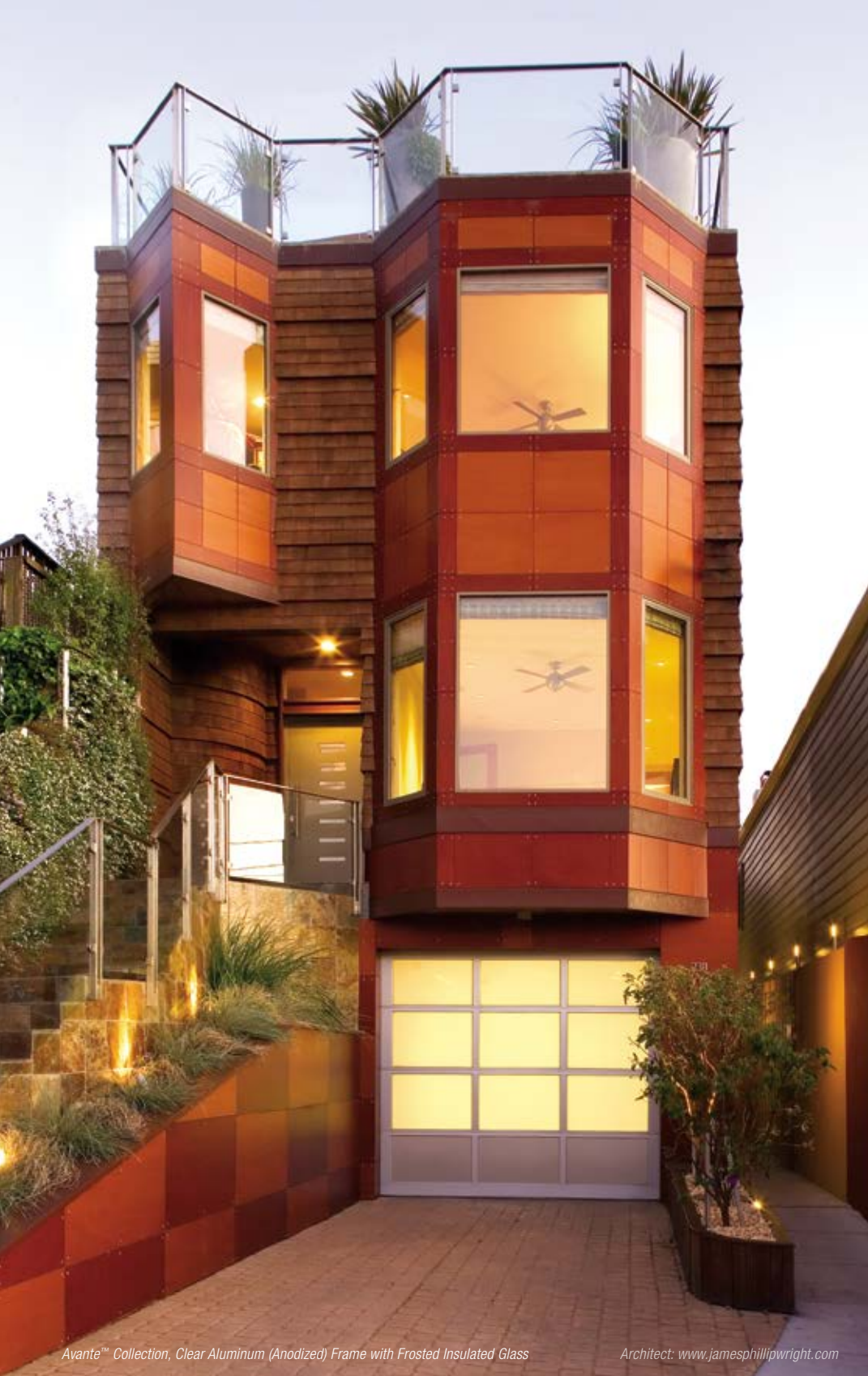
Avante™ Collection, Clear Aluminum (Anodized) Frame with Frosted Insulated Glass